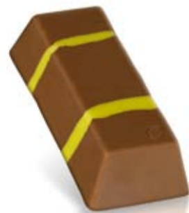
Tippy Toffee Apple

This one is all about the delicate flavours and striking, all-natural colours of pistachios – finely ground then blended with creamy white chocolate and a little almond paste to enhance the melt-in-the-mouth experience. Encased in a caramel chocolate shell and finished with a naturally green spot.