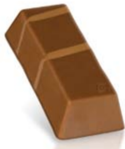
Single Malt Smoothie

Caramel is undoubtedly one of the more laid back flavours, but we've given this one a zesty twist to pep things up. Inside there's smooth caramel softened even further with a splash of orange liqueur and a zesty dash of essential oil of Valencia orange. Finished with all natural white and orange stripes.