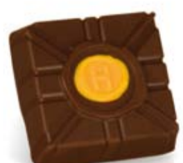
Dark Sticky Toffee

This super soft hazelnut praline will melt away the mouth and, as it does, you'll feel the gentle tingle of chilli slowly sneaking up on you, leaving you with lingering chocolaty flavours and a gently glowing warmth. Encased in milk chocolate and finished with red pepper flakes.