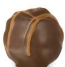
Rum Hot Shot

No matter what time of day you choose to taste this chocolate, it will leave you with that relaxed café latte feeling. It has all the right attributes – a silky smooth milk chocolate ganache, with lingering flavours of Columbian coffee and cream. Finished with the classic ruffled truffle look.