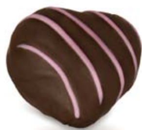
Raspberry & Prosecco

The naturally creamy flavours of macadamia and coconut blended together in a light crème then encased in a white chocolate shell.